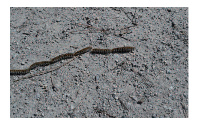
Fig. 1. Pine processionary moths during procession. The species Thaumetopoea pityocampa is notable for the behaviour of its caterpillars, which overwinter in tent-like nests high in pine trees, and which process through the woods in nose-to-tail columns, protected by their severely irritating hairs.

The caterpillar of pine processionary (Thaumetopoea pityocampa) moth and of other 200 species from Lepidoptera order are known as responsible for producing strong inflammatory reaction after skin contact in man and in animals [1–5]. The subfamily Thaumetopoeinae consists of about 100 species. The distribution of this moth includes mainly Mediterranean countries, Central Europe and Africa. The most common species are Thaumetopoea wilkinsoni with distribution in Near East and Turkey and Thaumetopoea pityocampa which is found in Mediterranean countries. Thaumetopoea pinivora and Thaumetopoea processionea are found in countries of central Europe (e.g. Poland) [6].