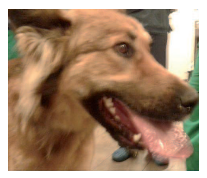
Fig. 2. Severe tongue swelling after contact with pine processionary caterpillar

The dogs usually have a contact with pine processionary caterpillars (PPC), when those are making a procession. Sometimes it can occur when a nest has fallen or occasionally when caterpillar's hair are blown by the wind. The consequences of this contact depend on body part that was in contact, the range of contact and finally how early treatment is applied. The most frequent localization is oral, and as a sequel normally stomatitis is produced. If it is more limited it can be called glositis or cheilitis. The patology is basically a toxine-mediated irritative dermatitis [11,12]. Histopathologically it can be considered as necrotic stomatitis proceeded by two phases: erosive and ulcerative. Depending on the time the treatment is applied progression or total recovery may be achieved. The erosive phase leaves intact epithelial basement membrane, while ulcerative deepens into the submucosa preventing its full restitution. Blepharitis and ulcers may occur if eyes are affected, especially when caterpillar's