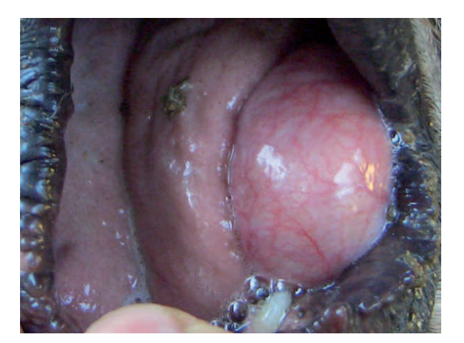
Fig. 6. Sublingual gland inflammation (ranula)

(ranula) may be produced (Fig. 6). Other frequent consequences are: hypertermia, tachypnoea, sinus tachycardia, conjunctivitis, labial angioedema and bilateral submandibular lymphadenomegaly. In extreme cases disseminated intravascular coagulation (DIC) may occur due to systemic inflammatory response which can finally lead to animal's death. In some pacients, 2–5 days after contact with PPC tongue necrosis and sloughing of its distal portion can appear. Sometimes parenteral or enteral alimentation is needed.