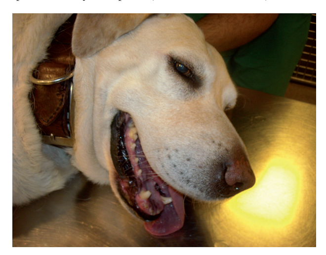
Fig. 3. Tongue oedema